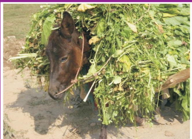
It's a donkey's life: Carrying dinner but unable to eat it